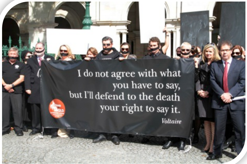
Union members gathered at a silent protest outside Parliament House, sending a clear message that the proposed legislation is unacceptable.

Record numbers turned out for the Labour Day march in Brisbane, despite the public holiday being moved by the government without consultation. Members marched under the IEUA-QNT banner to celebrate enhancements to working conditions achieved by their collective strength. QLD members rallied against proposed changes to workers' compensation laws.